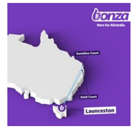
New direct flights