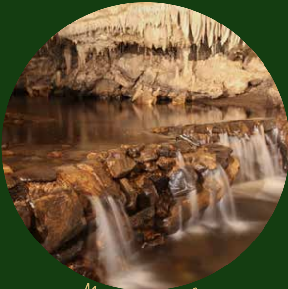
Mole Creek Caves

Heading a further 15 minutes West, visit the Mole Creek Karst National Park, featuring an extensive landscape of caves, sinkholes, gorges, streams and springs that weave their way below the surface, these amazing and not to be missed natural attractions form part of the Tasmanian Wilderness World Heritage Area.