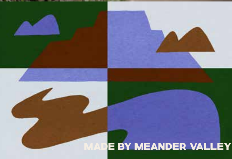
MADE BY MEANDER VALLEY