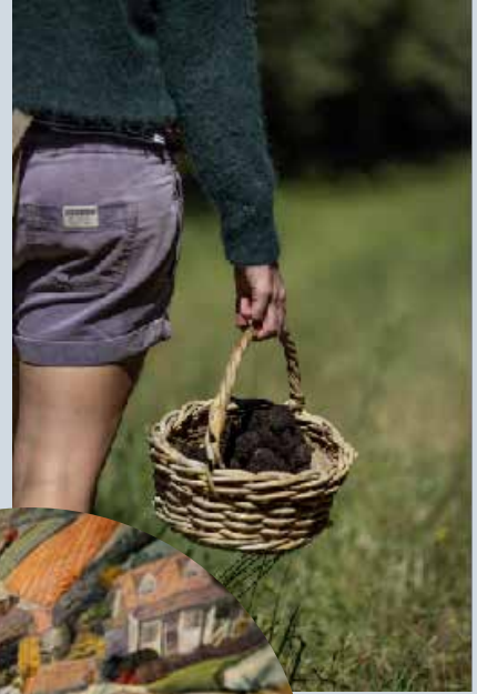
Truffle Farm Tasmania

Take some extra time to step back into Tassie's past and explore the onsite Folk Museum followed by the captivating Silk Yarns Exhibition . A unique handmade art-piece, Yarns was created using numerous hand working techniques and showcases the landscapes, culture and heritage of the Meander Valley people.