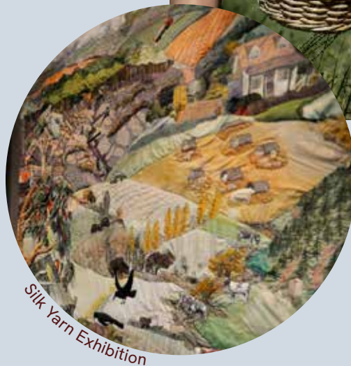
Silk Yarn Exhibition