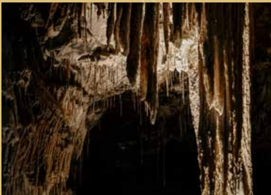
Mole Creek Caves

Enjoy an early picnic lunch overlooking the spectacular Mersey River Gorge before heading off on your adventures to Mole Creek Caves.