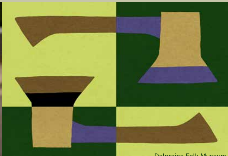
Deloraine Folk Museum