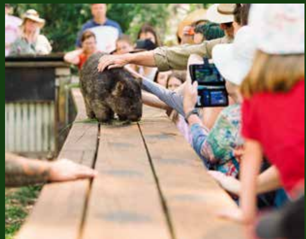
Trowunna Wildlife Park

This is not just a stop along the way—it’s a moment to slow down, breathe in the fresh country air, and feel the heartbeat of Tasmania’s wild heritage.